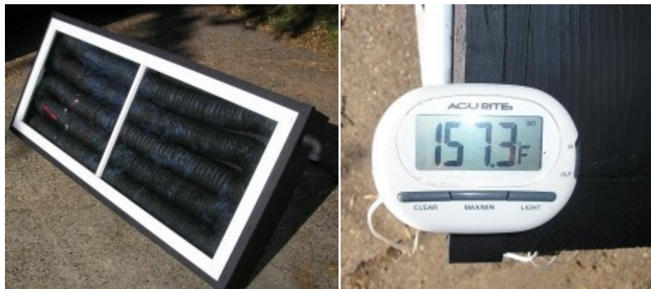
Figure. Solar heating kit produces 160° of free heat

Key Fact: Campers and students do better with hands-on activities when it comes to learning about energy and economics!